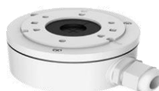
DS-1280ZJ-XS Junction Box